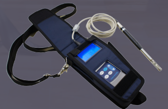
Hands-free Case now available!