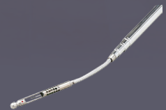
Telescopic, articulating probe